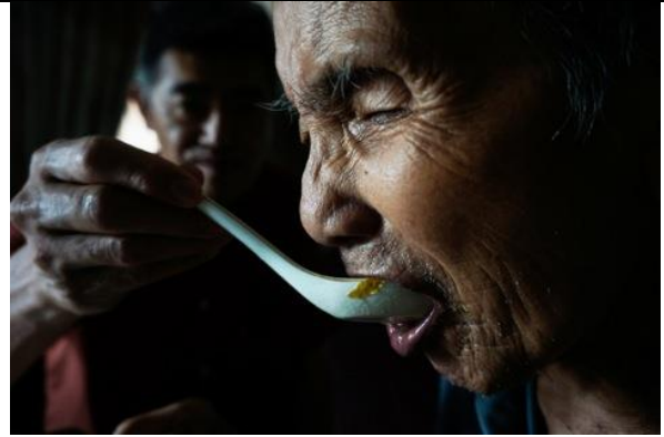
A poignant portrait capturing an intimate moment of the photographer’s father feeding her grandfather a month before he passed away.