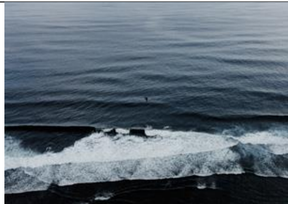
‘Boundless’: Captured through the photographer’s mobile phone, this photo taken at Uluwatu, Bali, portrays the boundlessness and wide expanse of mother nature.