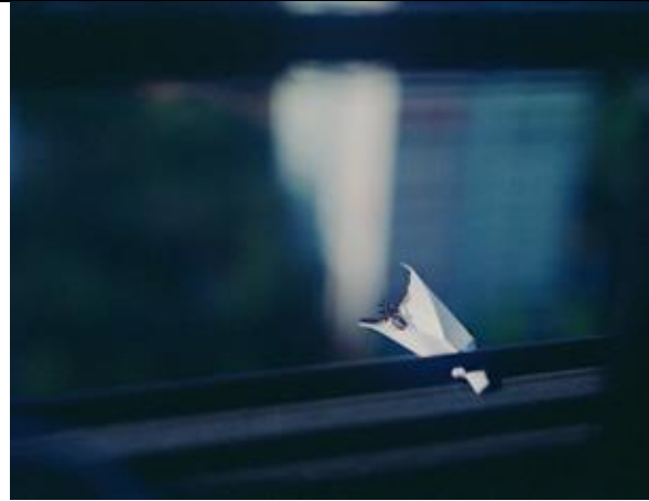
Part of the series themed “The Quiet Voice, Inside” which illustrates the photographer’s abstract feelings and thoughts about the human condition, this photo shows a dying insect on a window ledge, left for the wind to blow it away.