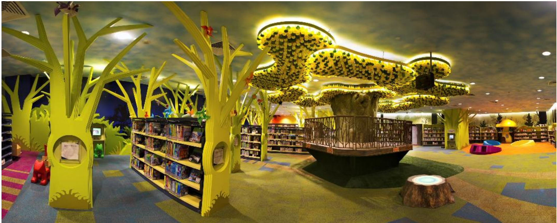
The canopy of the tree house comprises over 3,000 recycled plastic bottles and takes centre stage at “My Tree House”