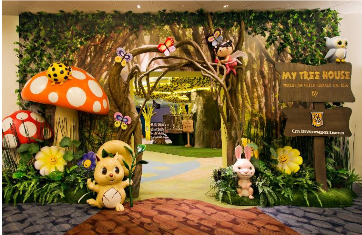
“My Tree House”

An enchanting and magical green space to encourage children to read and learn about the environment in a fun and interactive way.