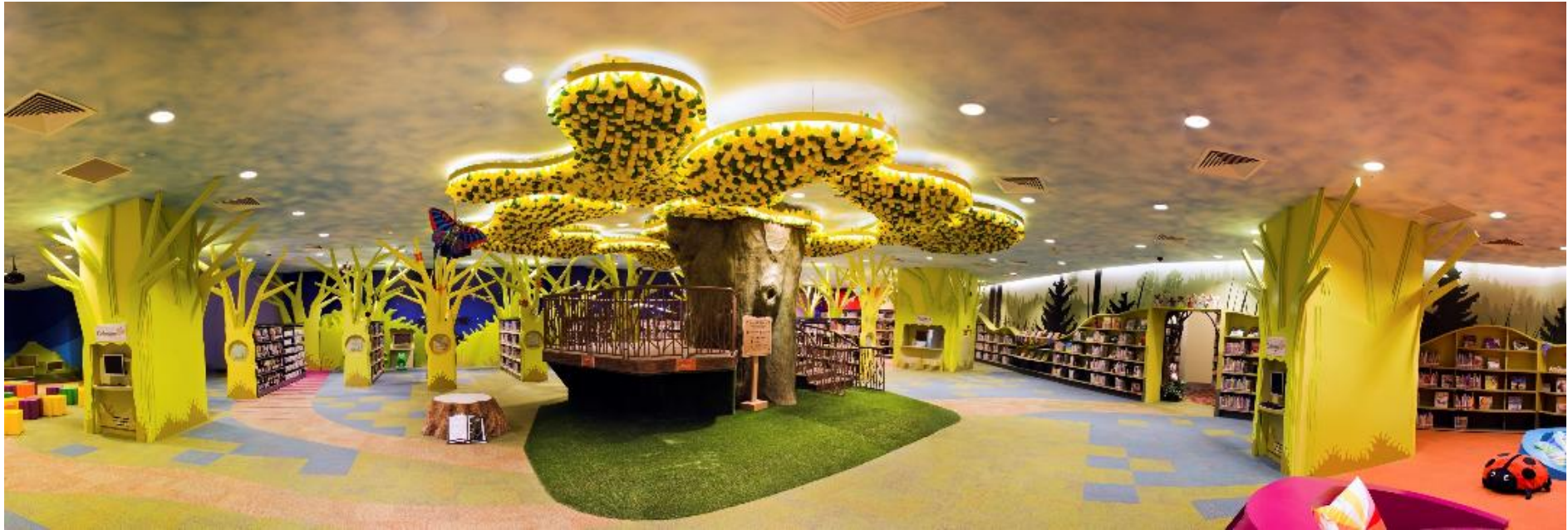
An innovative first-of-its-kind Green Library, “My Tree House” has been specifically designed, conceptualised and managed with environmental sustainability and children in mind.