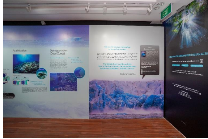
[Zone 4] Your Part in Ocean Action

Visitors will be greeted by stunning underwater photographs of marine life and images of the polar regions, transporting them to the depths of the seas.