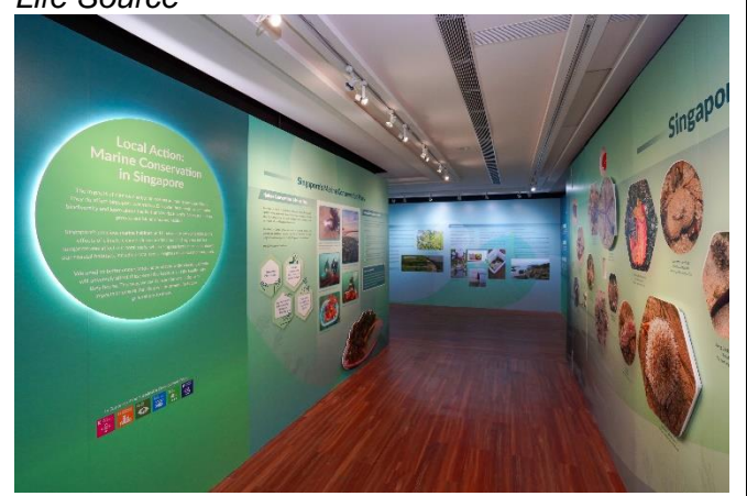
[Zone 2] Local Action: Marine Conservation in Singapore