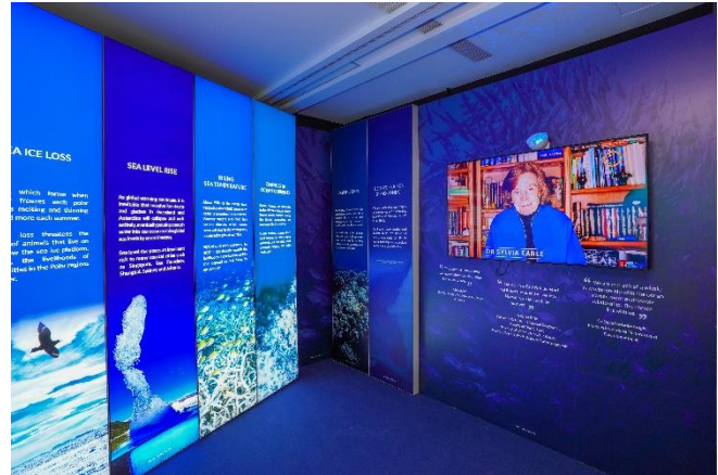
[Zone 1] Global Action: Protecting the Ocean, Our Life Source

Visitors will be "immersed underwater" as they enter the exhibition, mimicking the view of life below water.