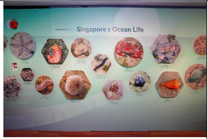
[Zone 2] Local Action: Marine Conservation in Singapore