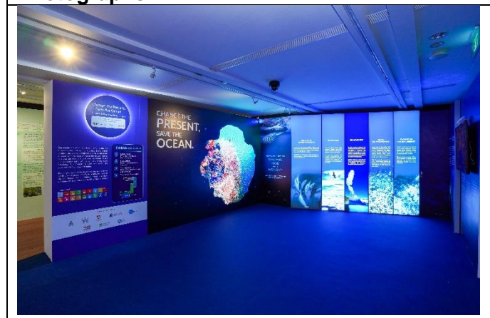
[Zone 1] Global Action: Protecting the Ocean, Our Life Source