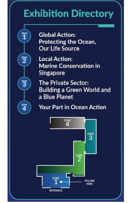
The exhibition comprises four zones: