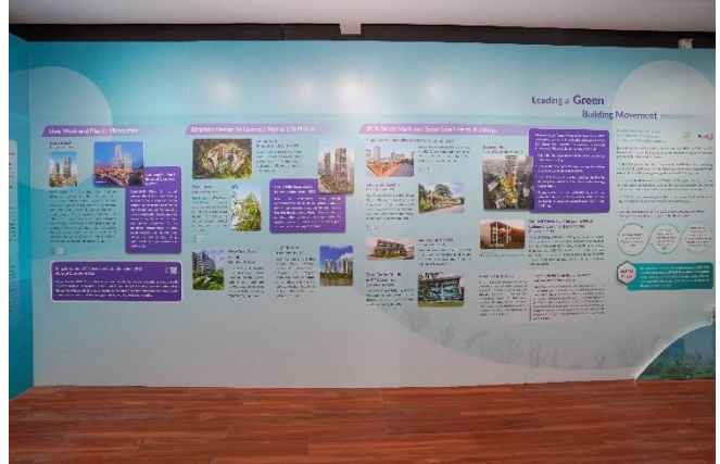
[Zone 3] The Private Sector: CDL and the Green Building Movement