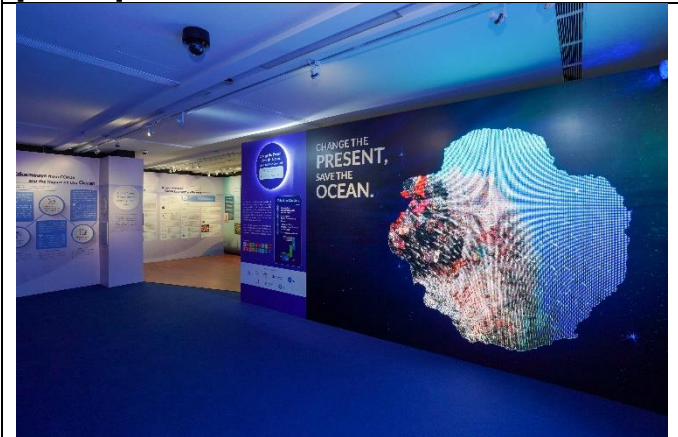
[Zone 1] Global Action: Protecting the Ocean, Our Life Source