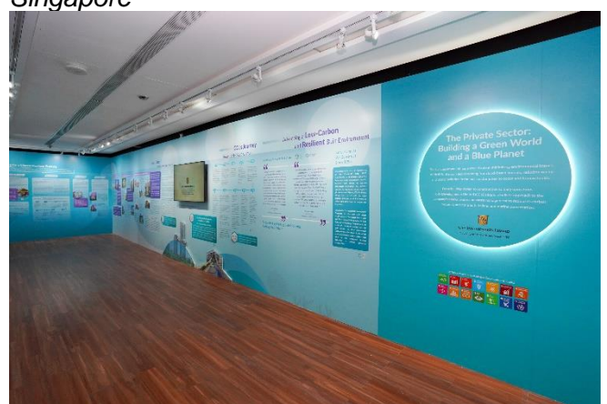
[Zone 3] The Private Sector: CDL and the Green Building Movement