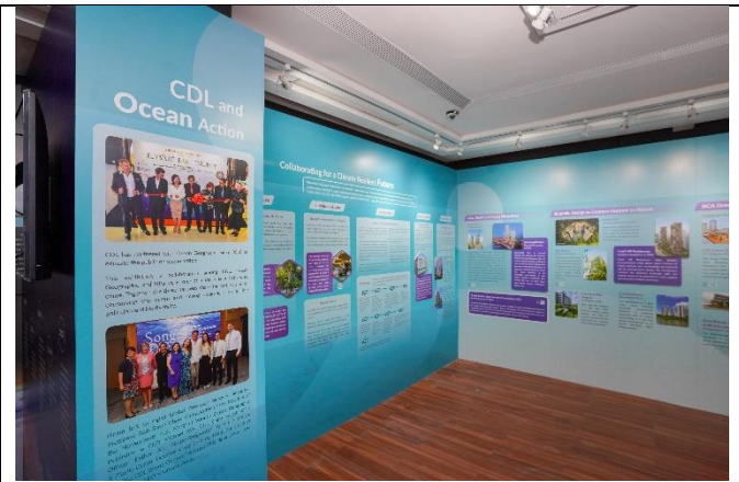
[Zone 3] The Private Sector: CDL and the Green Building Movement